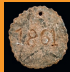
Wilson's Creek National Battlefield